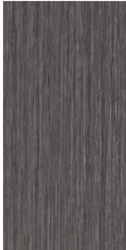
seagrass carbon 1648 [100.00 x 20.00]