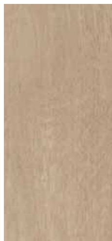
blond oak 1615 [100.00 x 20.00]