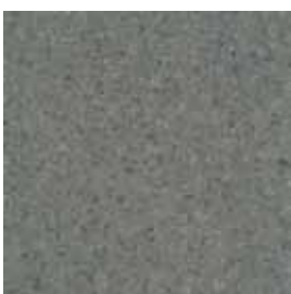
cement stone 1673 [50.00 x 50.00]