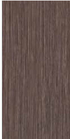
seagrass timber 1646 [100.00 x 20.00]