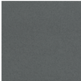
cool sand 1656 [50.00 x 50.00]