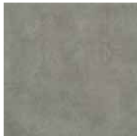
concrete sabbia 1631 [50.00 x 50.00]