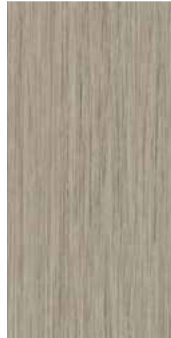
seagrass oyster 1644 [100.00 x 20.00]