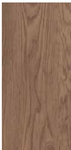
ash oak 1602 [100.00 x 20.00]