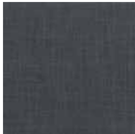
graphite weave 1664 [50.00 x 50.00]