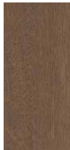
warm oak 1617 [100.00 x 20.00]