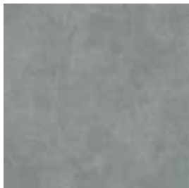
concrete grigio 1633 [50.00 x 50.00]

For the important stone group there are a number of different design characteristics. Next to the contemporary concrete design, there is also a fine sand all-over look and a classic terrazzo interpretation. All in easy to integrate contemporary colourways ranging from neutral tones and cool greys to dark anthracite colours.