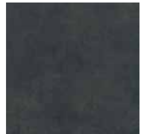
concrete nero 1634 [50.00 x 50.00]