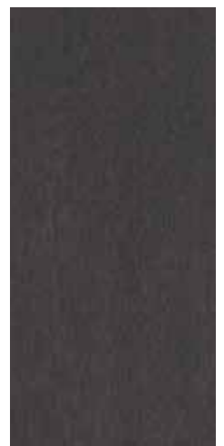
dark wengé 1616 [100.00 x 20.00]