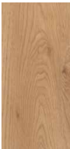
honey oak 1603 [100.00 x 20.00]

This group of wood designs forms the base of the collection and come in traditional and authentic wood types, like elegant and classic oak, with the wengé providing added impact. The colour palette of this range is diverse ranging from light to dark including whitewash oak, honey oak and dark rustic oak. The matt surface has a natural looking and characteristic fine woodgrain.