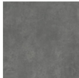
concrete natural 1632 [50.00 x 50.00]