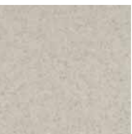
shell stone 1675 [50.00 x 50.00]