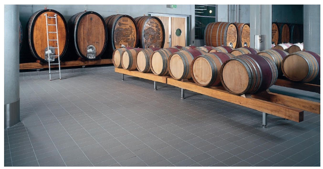
Apprenticeship and testing establishment, Weinsberg, Germany