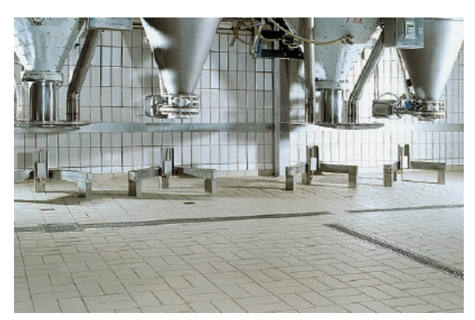
Production shed, Nuremberg, Germany

For AGROB BUCHTAL, the world-wide renowned company providing ceramic problem solutions, high-quality products and first-class service are inseparable. That is why planners and architects using our products can benefit from the know-how of our inhouse planning department - for competent support in all phases of the project.