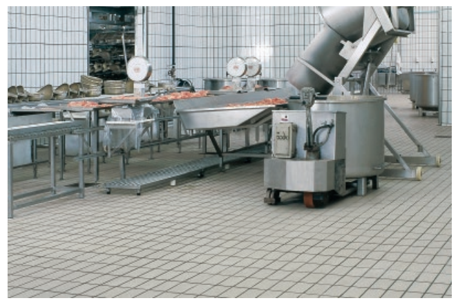
Meat processing, Castelnuovo, Italy