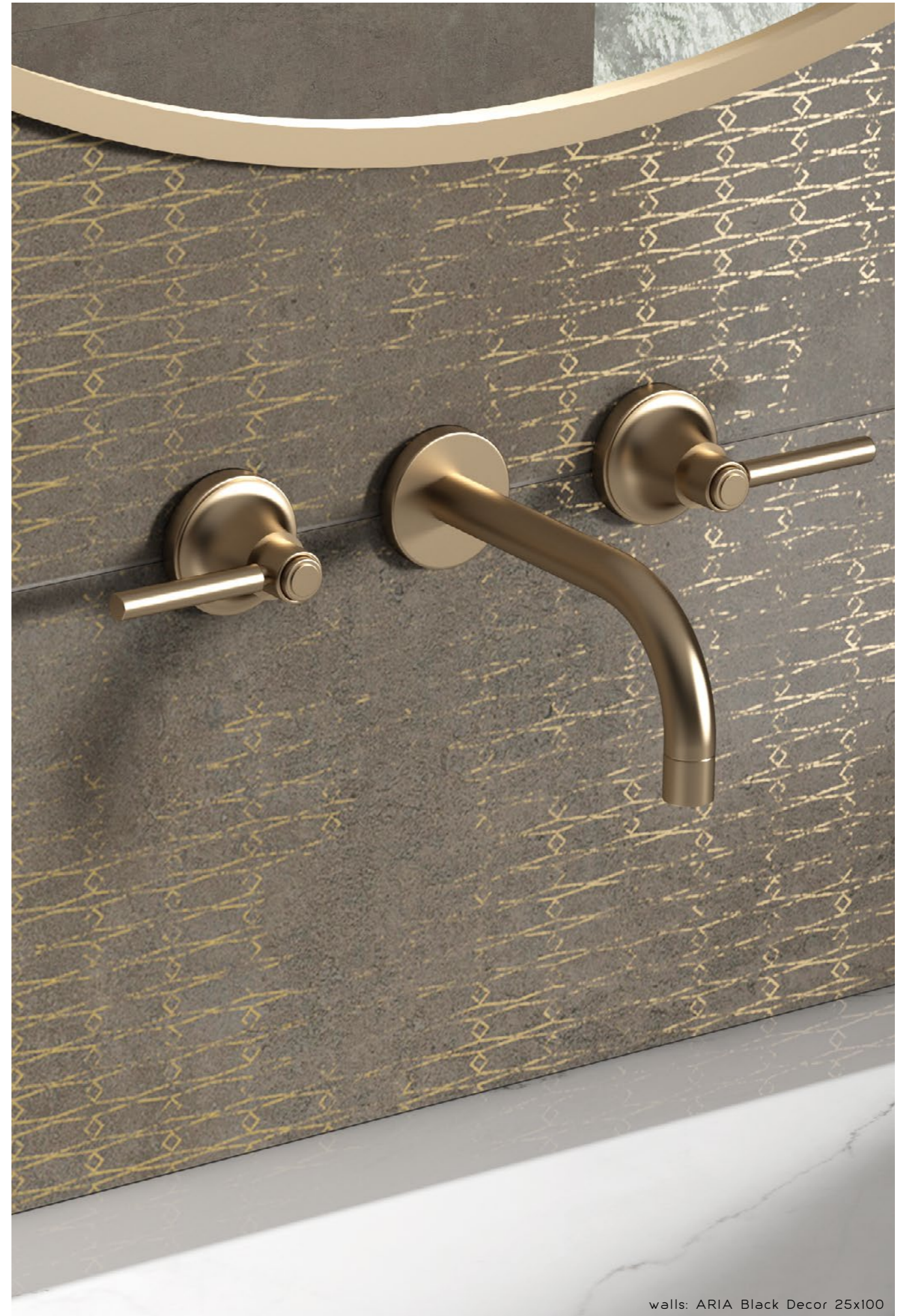
walls: ARIA Black Decor 25x100