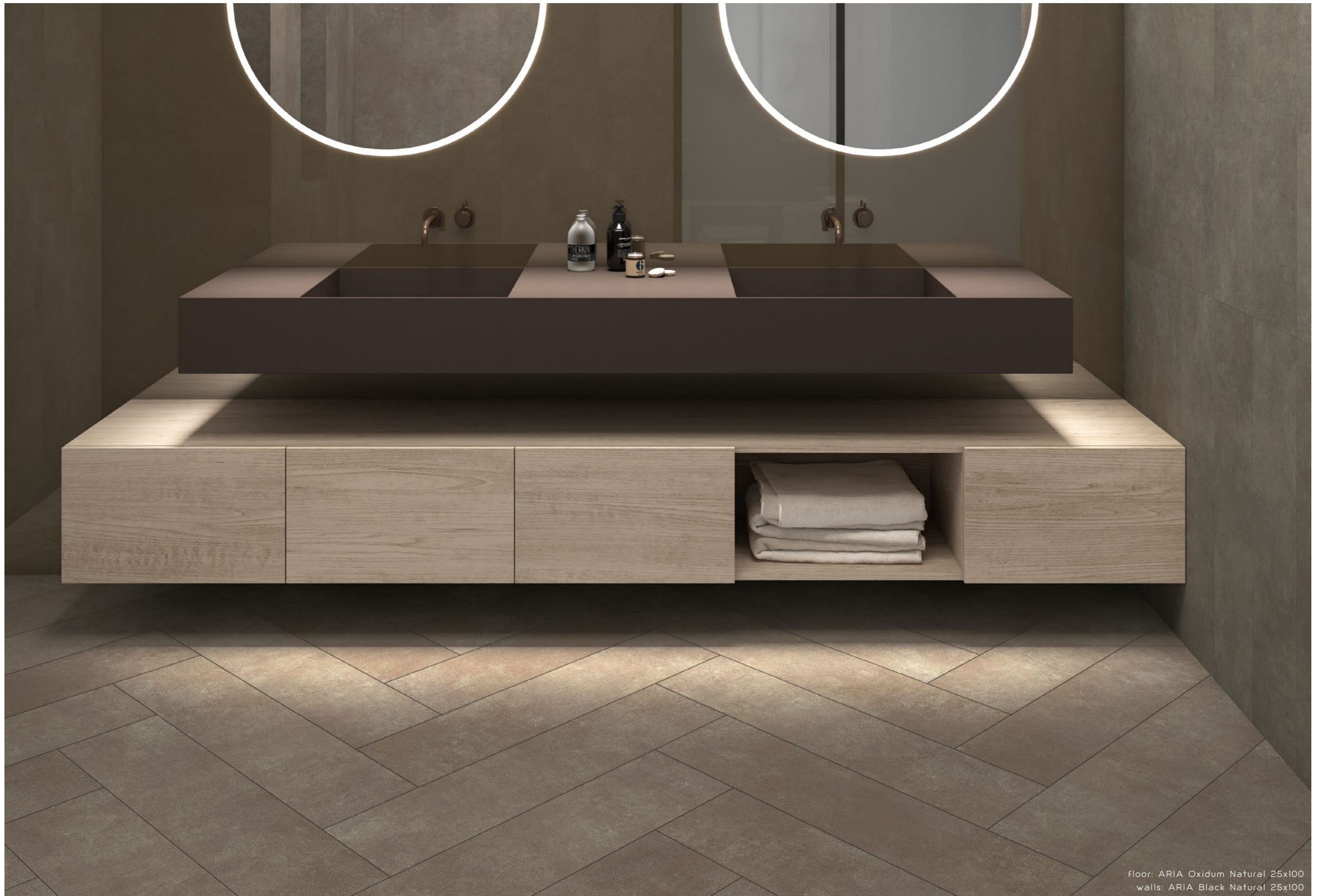
Floor: ARIA Oxidum Natural 25x100 walls: ARIA Black Natural 25x100