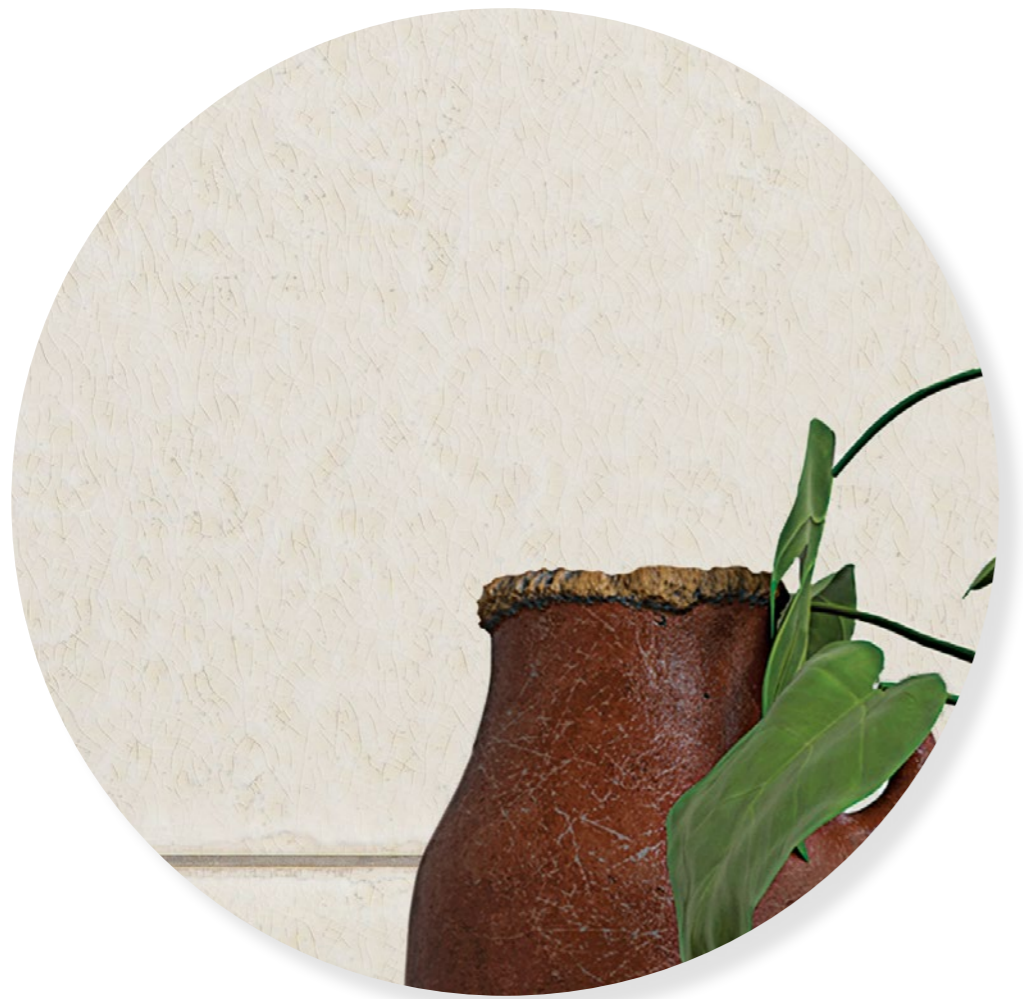
walls: CRAQUELLE Beige 25x100