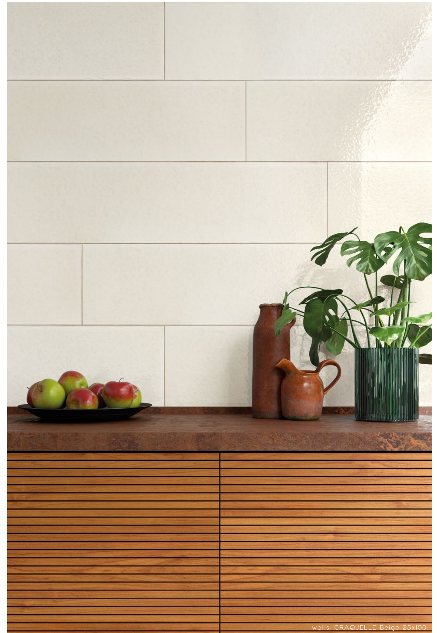
walls: CRAQUELLE Beige 25x100